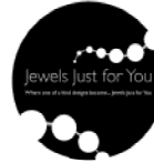
, Jewels Just for You