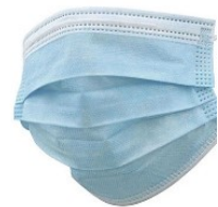
Disposable face m