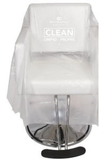
Disposable Chair C