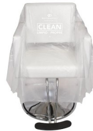
Disposable Chair Cover