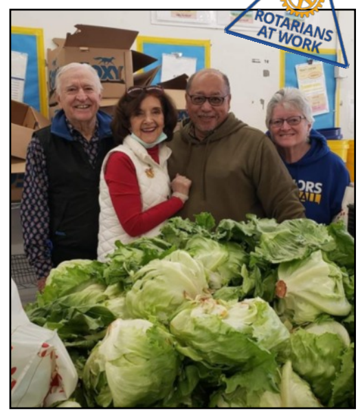
Be a volunteer!