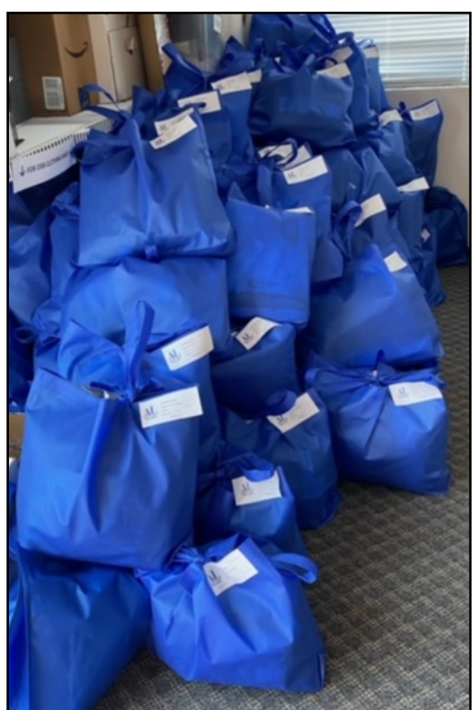
Great Day at the Assistance League!