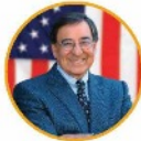
LEON PANETTA Former Secretary of State