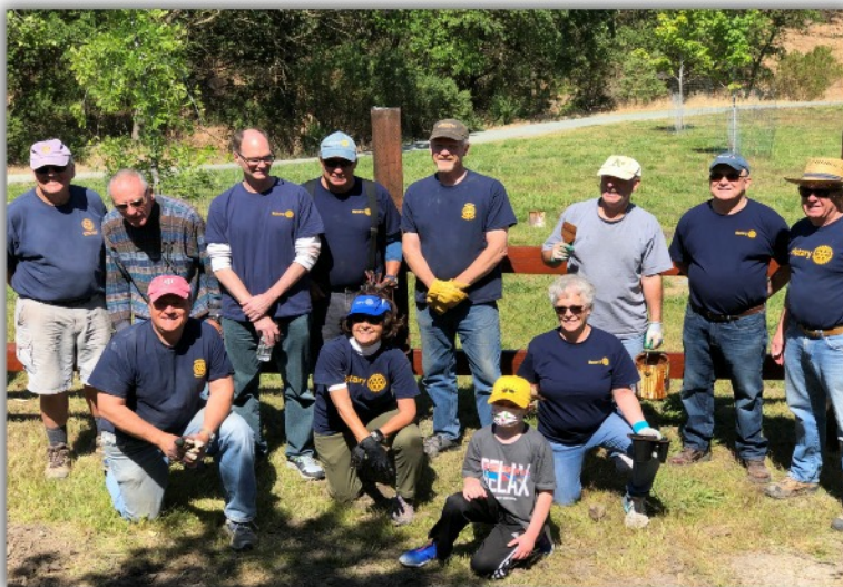
The Borges Ranch "Crew"

The Club work day at Borges Ranch was reported on last week. Here is a late submission of a photo of the entire team! Thanks to everyone who participated!