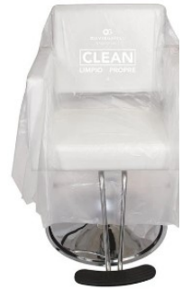
Disposable Chair C