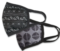
Printed Fabric Face Mask