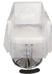
Disposable Chair Cover