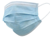
Disposable face mask